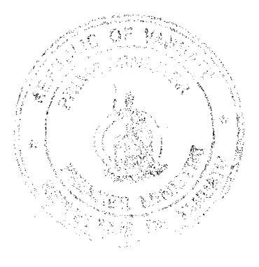
Honourable Edward Natapei Prime Minister of the Republic of Vanuatu