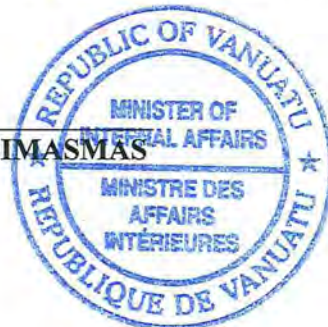
Honourable CHARLOT SALWAI TABIMASMAS Minister of Internal Affairs

Made at Port Vila this 07 day of October , 2014.